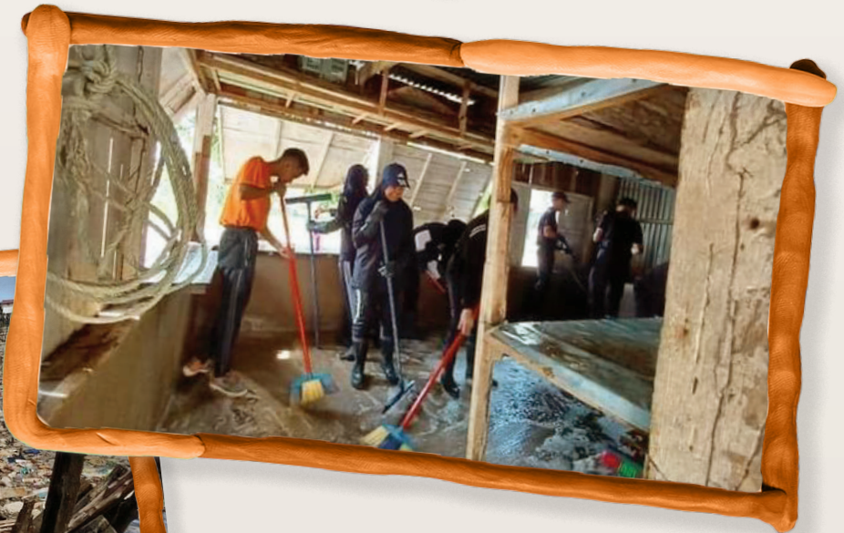
YSD travelled to Sandakan, Sabah, to provide aid to households whose homes were devastated by the high tide phenomenon.