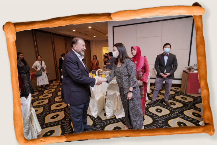
YAM Tunku Tan Sri Imran Ibni Almarhum Tuanku Jaafar and YB Hannah Yeoh, Member of Parliament for Segambut who was instrumental in pushing forward the Anti-Sexual Harassment Act.