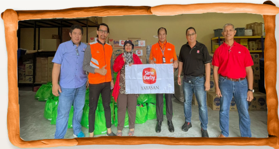
Another 8,100 relief items were provided in Johor in collaboration with Sime Darby Plantation.