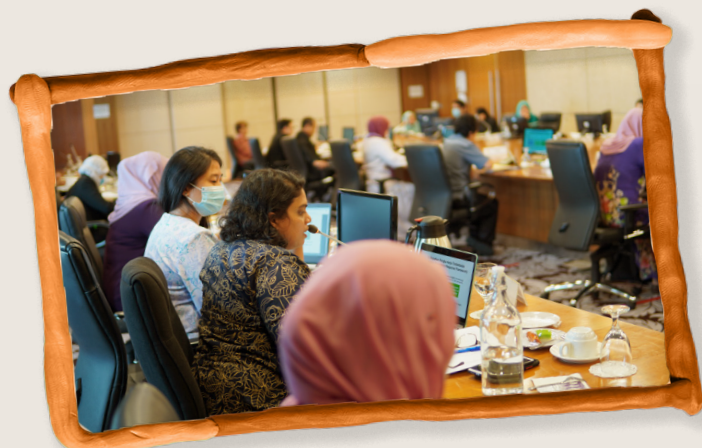
WAO presenting at the National Domestic Violence Committee meeting.