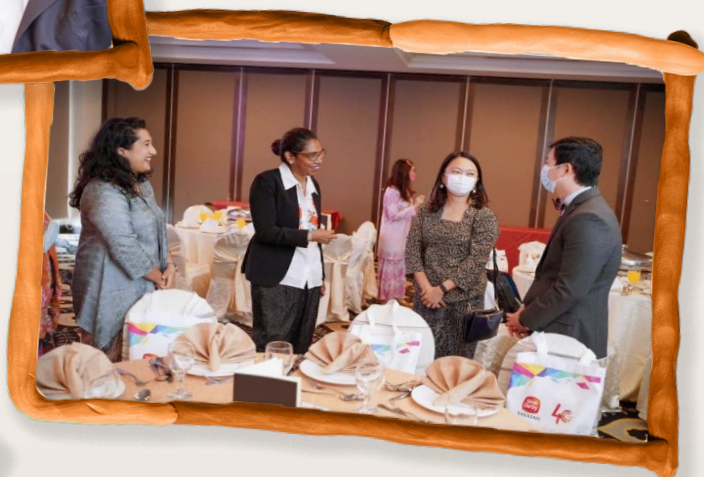
On 29 March 2023, the Dewan Rakyat passed amendments to the Penal Code and Criminal Procedure Code to make stalking a crime in Malaysia.