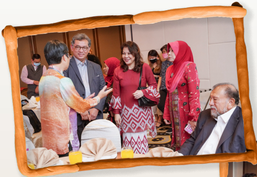
YSD hosted a luncheon in September 2022 to celebrate the historic milestone of the passing of the Anti-Sexual Harassment Bill 2021.